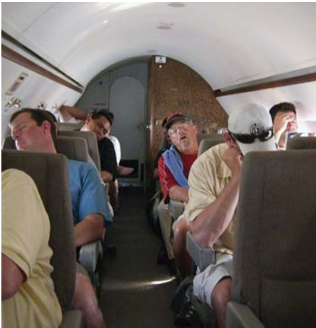
It's a long way to Kiritimati!