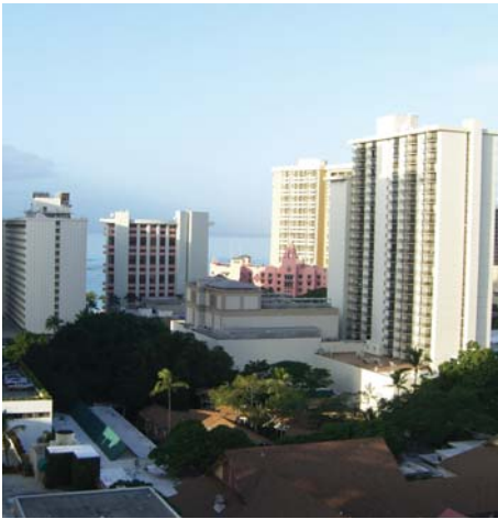
Waikiki - the adventure begins!