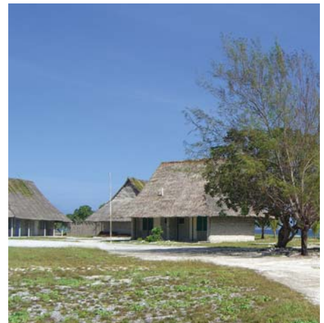
Our home for four weeks