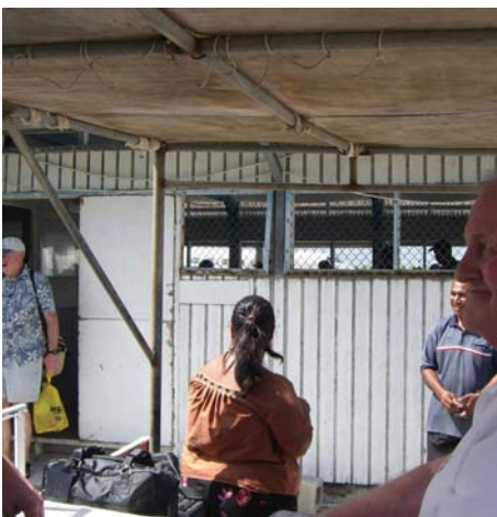
Airport, Christmas Island